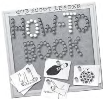
Cub Scout Leader How-To Book

“Cub Scout Leader How-to Book” BSA Item # 33602