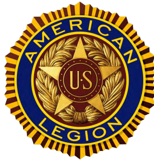
Sandra Edens (Post 124)